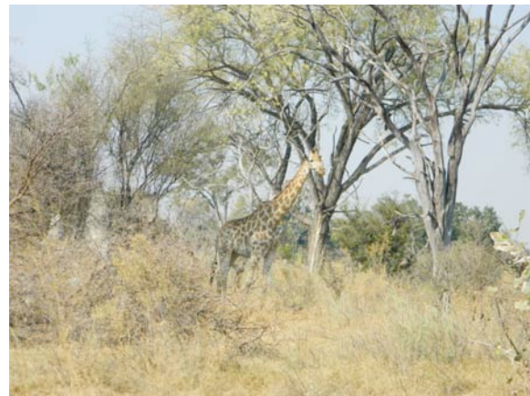
Giraffe in a natural setting in a Photographic Concession area (NG 31) in the Okavango Area.

The World Tourism Organization (1985, cited in Mckercher & Du Cros, 2002p3) describes cultural-heritage tourism as a form of tourism that deals with the movement of tourists and/or persons toward essentially cultural motivations, such as performing arts, attending cultural festivals and events, visits to sites and monuments, travel to memorial sites, archaeological sites and battle fields, folklore, art or pilgrimages (see Mckercher & Du Cros, 2002; Timothy & Boyd, 2006). Cultural heritage tourism is one of the most notable