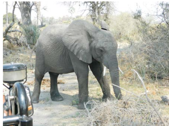
NG 31 Controlled Hunting Area, Okavango area. Photo by Naomi Moswete (September 2011).

Wildlife-based tourism is also considered as the most appealing form of land use in the country (Barnes, 2001; GOB, 2002; 2007; MFDP, 2009), as the major activity of safari hunting occurs in remote parts of the country, which creates jobs for rural communities where poverty levels are high. Trophy-animal hunting (e.g. elephant or buffalo) accrue high revenue for safari hunters and provide income for the rural resident communities (Gujadhur, 2001; Mbaiwa, 2003; 2008; Thakadu, Mangadi, Bernard et al., 2006). In all, wildlife-based tourism has been centered in and around the Okavango Delta and Chobe National Park, accounting for about 95% of visitations and 91% of revenue for all park-based eco-tourism activity in 2006 (WTTC, 2007).